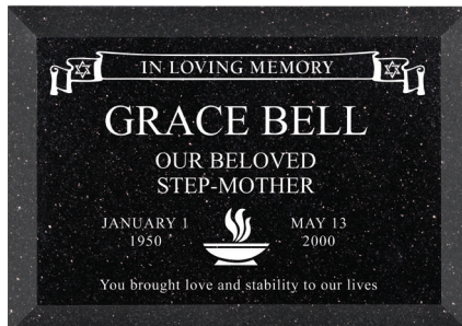
Galaxy Black | 28" x 20"