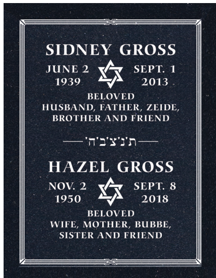
Ebony Black | 30" x 39"

All memorial tablets can take up to 3 months to produce once the design is approved.