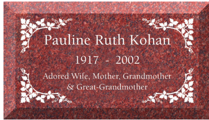
Bright Red | 28" x 16"